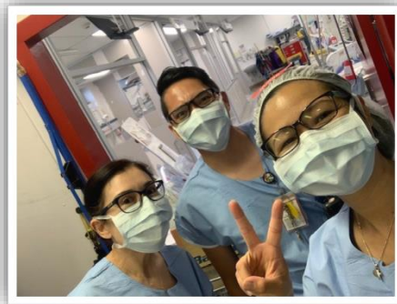
Photo of a parishioner and her work colleagues in a major Sydney hospital, on the coronavirus front lines