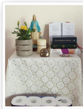
Home shrine photo sent in by parishioners, who were grateful to have found a supply of toilet rolls

Because of the restrictions on gatherings during the COVID-19 pandemic, we cannot have any big celebrations just now to mark this important anniversary for the Church in Australia, but we will certainly do so in the months to come.